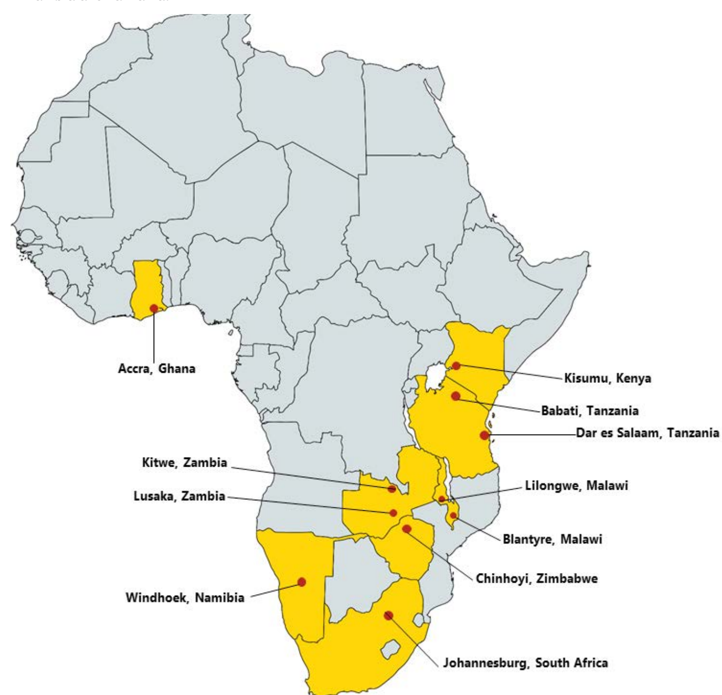
Figure 1: Map of SHARE's urban sanitation research in Africa

In 2011, SHARE published a Pathfinder paper on the challenges of urban sanitation and potential research gaps that the SHARE programme could address (Mulenga, 2011). Research gaps were identified in the areas of health impact, sustainable sanitation systems and effective behaviour change. Phase I of SHARE funded several urban sanitation projects. In Phase II, urban sanitation was selected as a strategic theme and two projects were funded in Zambia and Tanzania.