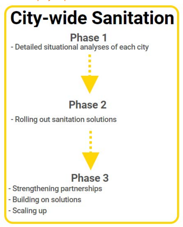
Figure 2: City-wide sanitation project phases